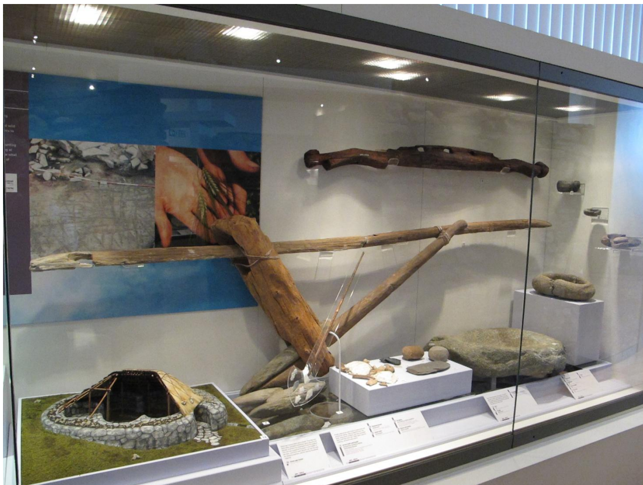
From the exhibition, Lerwick Museum