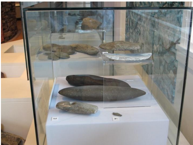
From the exhibition, Lerwick Museum