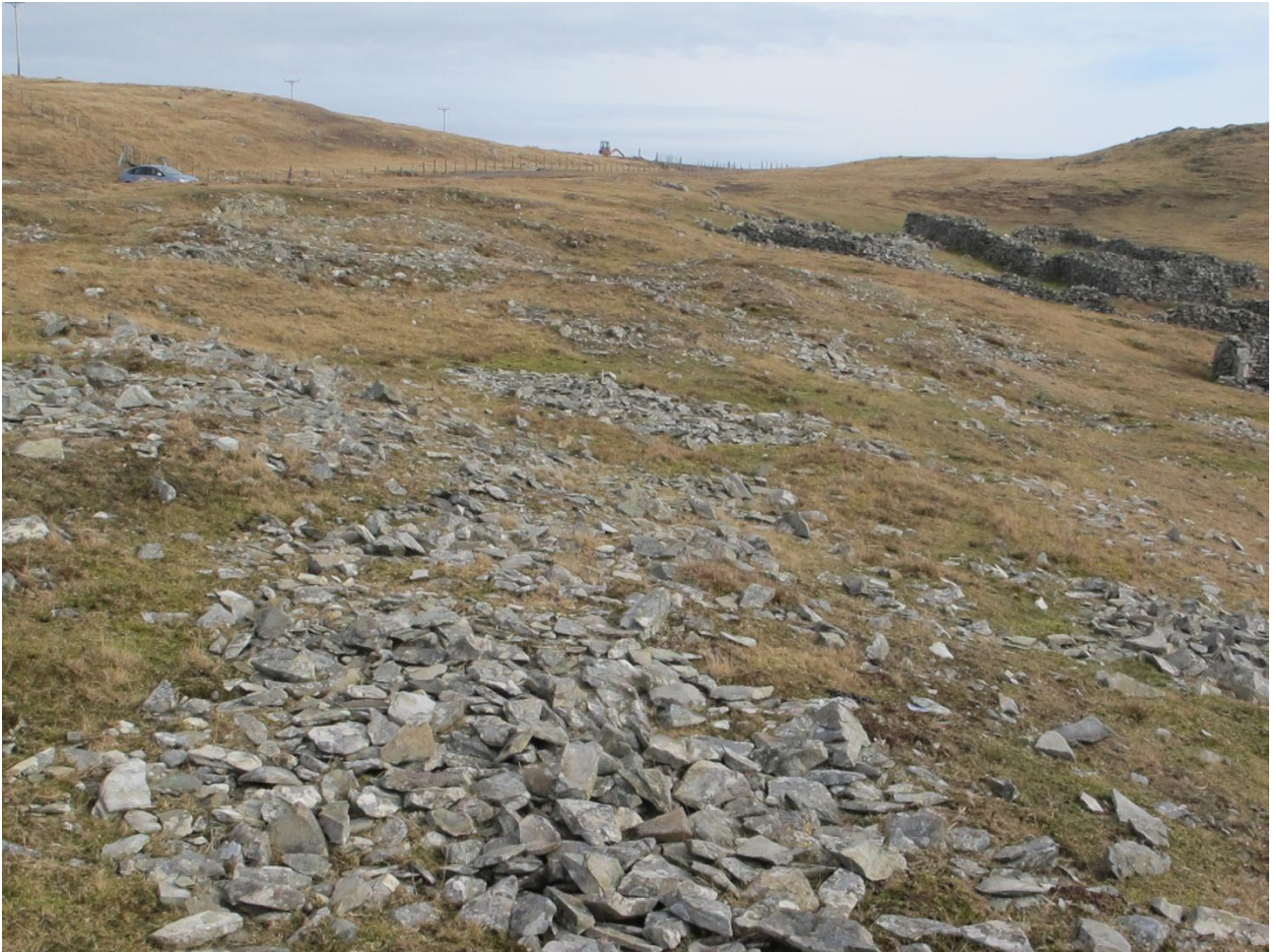
Knapping site near Walls, presumably Neolithic