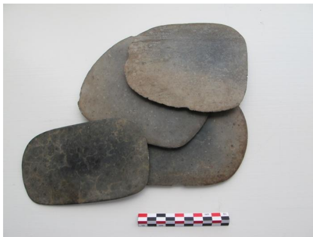
From the collections of the National Museum