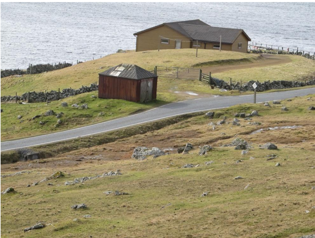
Gruting. Neolithic structure with recent shed built upon.