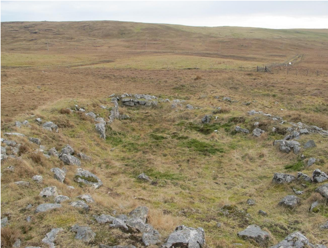
Stanydale. Neolithic house structure