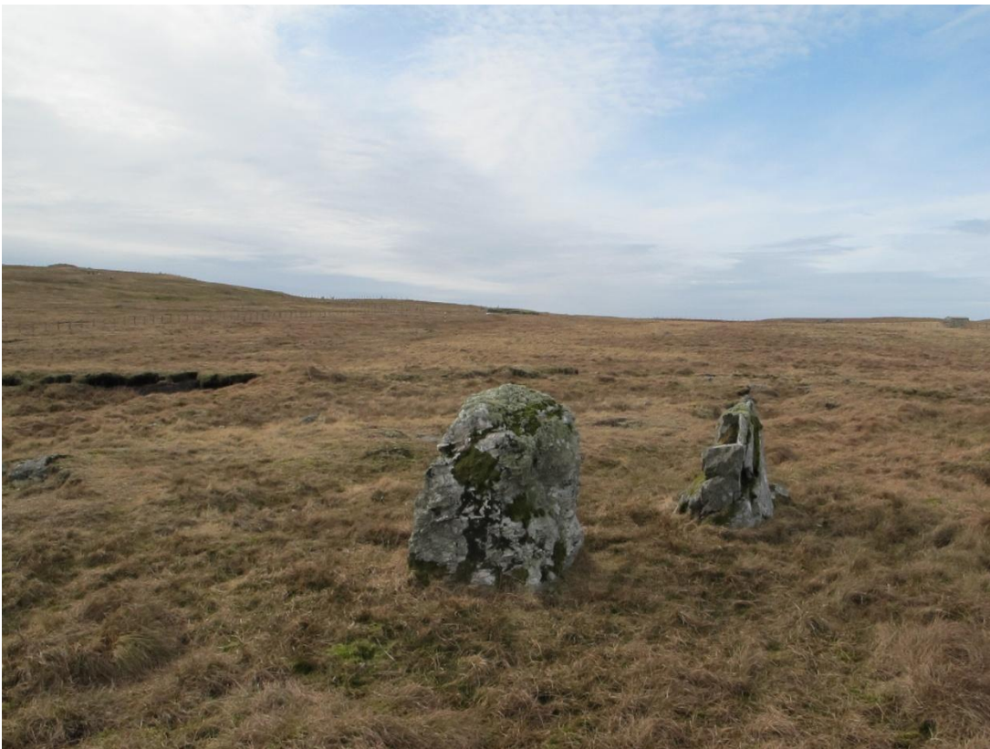
Stanydale; standing stones