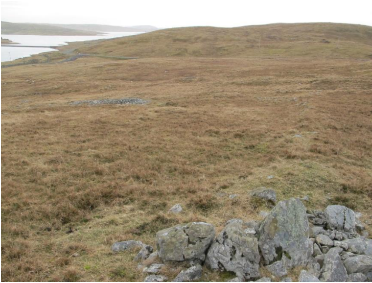
Scord of Brouster, House 3 and banks.