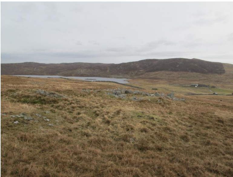
Scord of Brouster, House 1; Neolithic landscape