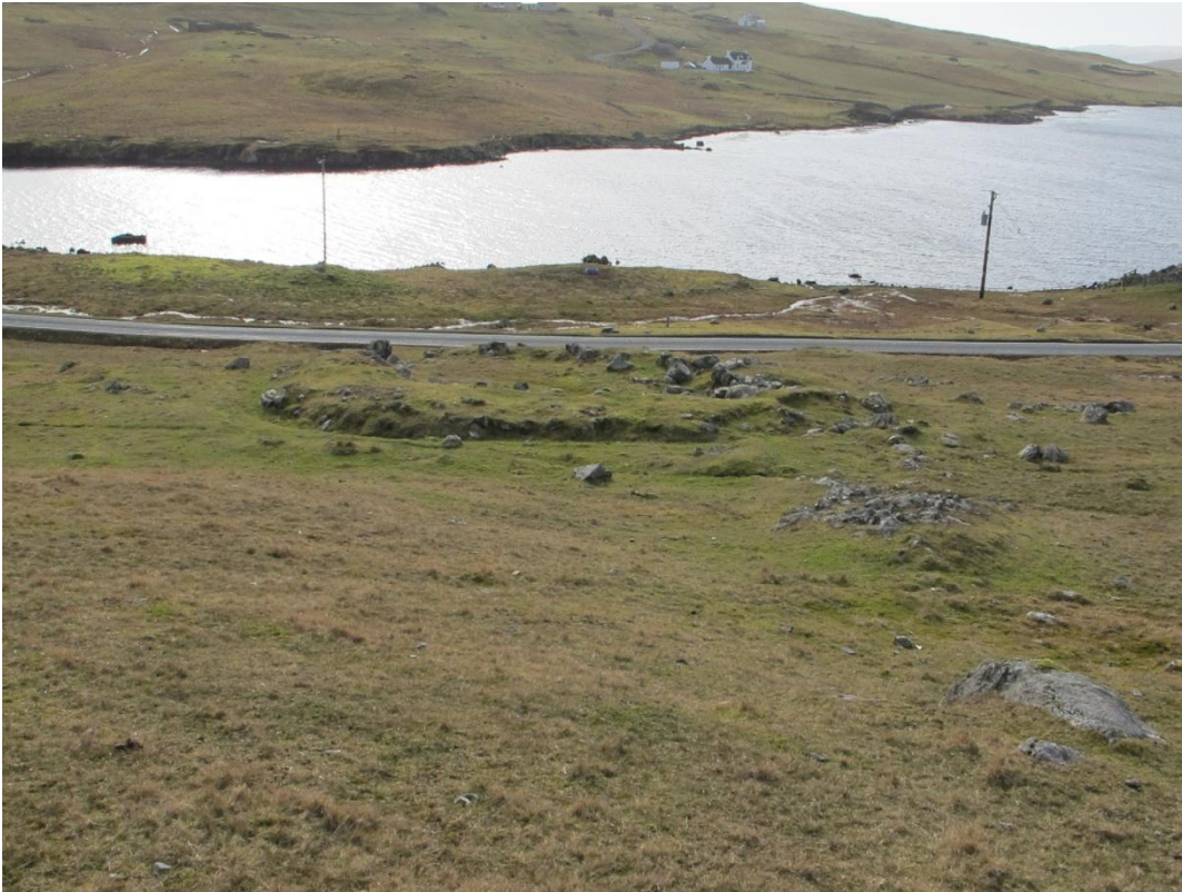
Gruting, Neolithic house site